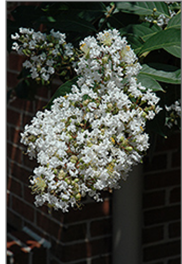
Natchez Crapemyrtle flowers

This is a relatively low maintenance tree, and is best pruned in late winter once the threat of extreme cold has passed. Deer don't particularly care for this plant and will usually leave it alone in favor of tastier treats. It has no significant negative characteristics.