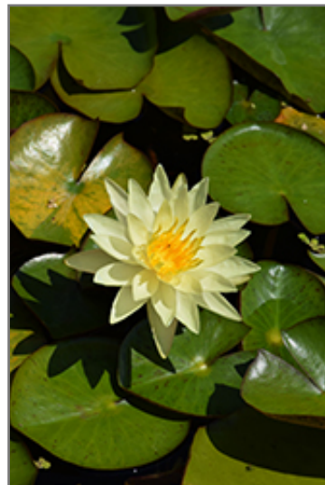
Charlene Strawn Hardy Water Lily flowers

Charlene Strawn Hardy Water Lily is ideally suited for growing in a pond, water garden or patio water container, and is recommended for the following landscape applications;