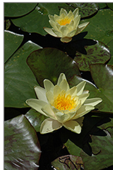
Charlene Strawn Hardy Water Lily flowers