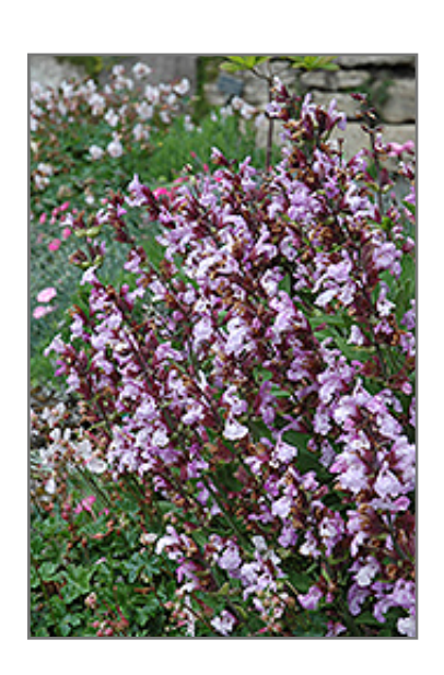
Dwarf Sage flowers

Aside from its primary use as an edible, Dwarf Sage is sutiable for the following landscape applications;