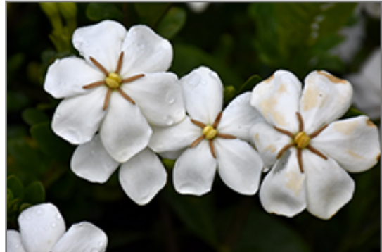
Kleim's Hardy Gardenia flowers