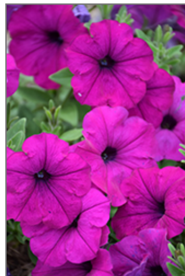
Easy Wave Violet Petunia flowers