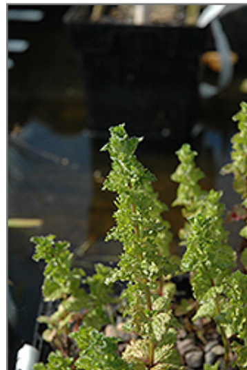
Curly Mint foliage