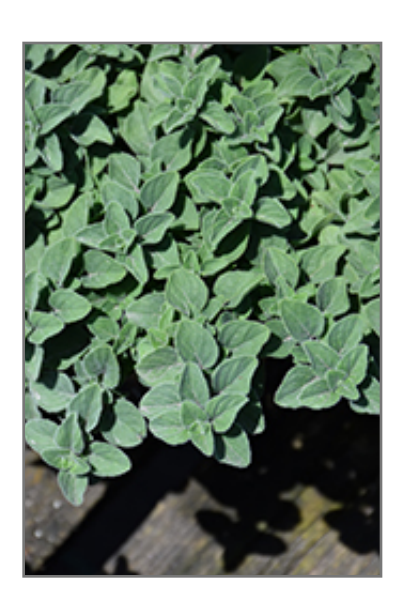
Hot And Spicy Oregano foliage

Aside from its primary use as an edible, Hot And Spicy Oregano is sutiable for the following landscape applications;