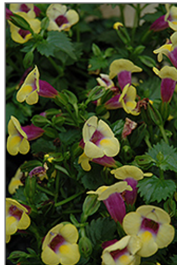
Yellow Moon Torenia flowers

Yellow Moon Torenia is recommended for the following landscape applications;