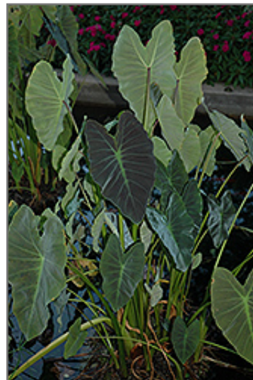
Coal Miner Elephant Ear foliage