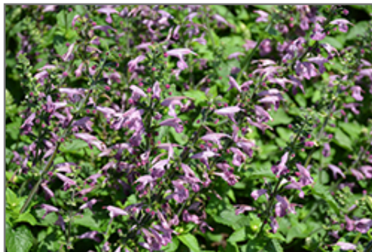
Summer Jewel Lavender Sage flowers

Summer Jewel Lavender Sage is recommended for the following landscape applications;