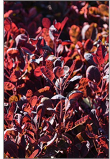
Velveteeny Purple Smokebush foliage

Velveteeny Purple Smokebush makes a fine choice for the outdoor landscape, but it is also well-suited for use in outdoor pots and containers. With its upright habit of growth, it is best suited for use as a 'thriller' in the 'spiller-thriller-filler' container combination; plant it near the center of the pot, surrounded by smaller plants and those that spill over the edges. It is even sizeable enough that it can be grown alone in a suitable container. Note that when grown in a container, it may not perform exactly as indicated on the tag - this is to be expected. Also note that when growing plants in outdoor containers and baskets, they may require more frequent waterings than they would in the yard or garden.