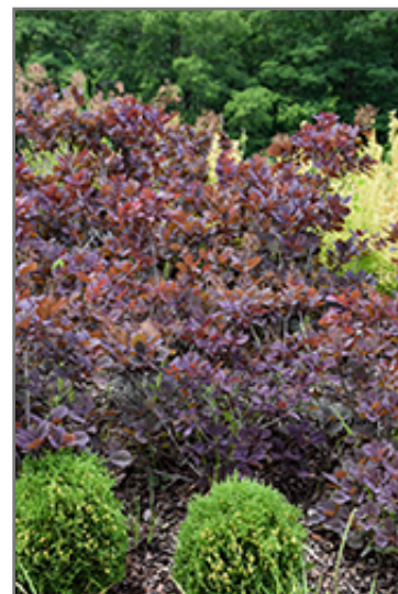
Velveteeny Purple Smokebush