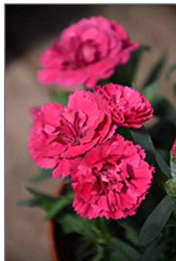
Oscar Cherry and Velvet Carnation flowers