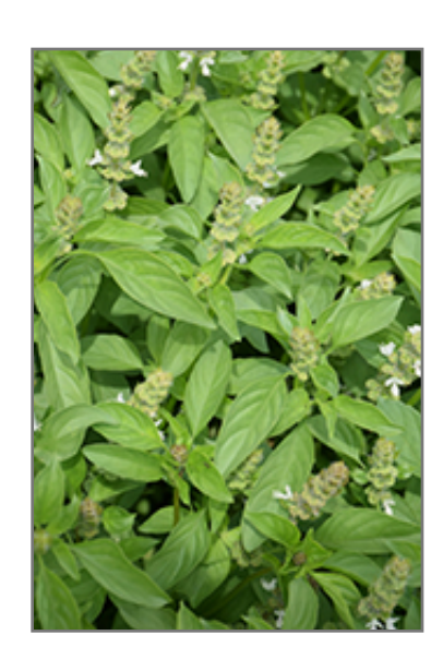
Lime Basil foliage

Lime Basil will grow to be about 20 inches tall at maturity, with a spread of 20 inches. When grown in masses or used as a bedding plant, individual plants should be spaced approximately 16 inches apart. This fast-growing annual will normally live for one full growing season, needing replacement the following year.