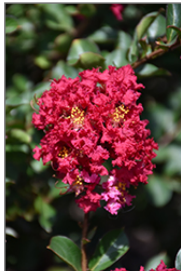
Princess Holly Ann Crapemyrtle flowers