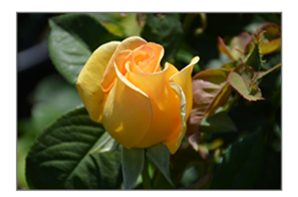
Gold Struck Rose flower buds

Lititz • Rohrerstown • Lancaster • East York • Dover • Linglestown • Mechanicsburg • Hummelstown www.skh.com