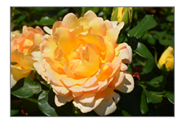
Gold Struck Rose flowers

Gold Struck Rose is recommended for the following landscape applications;