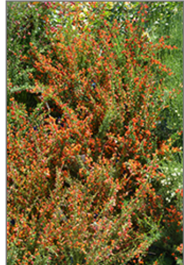
Lena Scotch Broom in bloom

This shrub should only be grown in full sunlight. It prefers dry to average moisture levels with very well-drained soil, and will often die in standing water. It is considered to be drought-tolerant, and thus makes an ideal choice for xeriscaping or the moisture-conserving landscape. It is particular about its soil conditions, with a strong preference for clay, alkaline soils, and is able to handle environmental salt. It is highly tolerant of urban pollution and will even thrive in inner city environments. This particular variety is an interspecific hybrid.