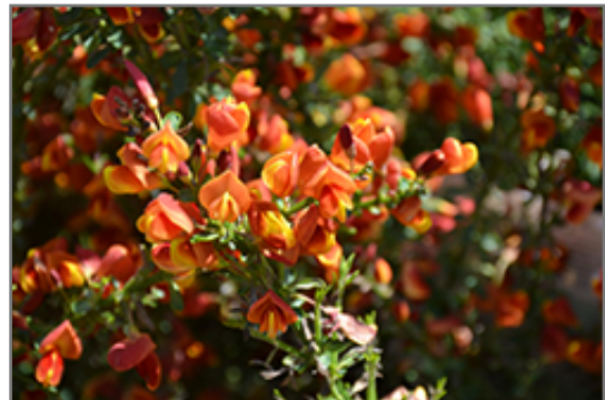
Lena Scotch Broom flowers