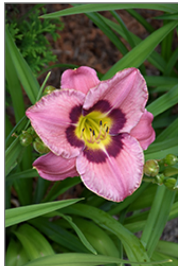
Always Afternoon Daylily flowers