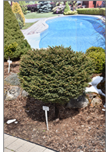
Little Gem Spruce (tree form)