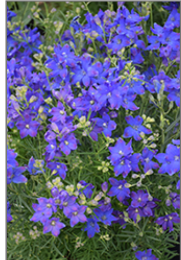
Diamonds Blue Delphinium flowers