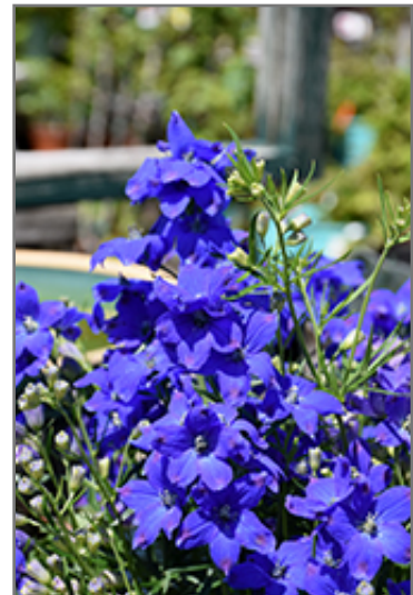
Diamonds Blue Delphinium flowers