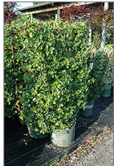
Manhattan Spreading Euonymus