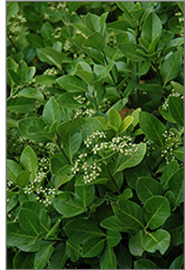
Manhattan Spreading Euonymus flowers

This shrub performs well in both full sun and full shade. It is very adaptable to both dry and moist locations, and should do just fine under average home landscape conditions. It is not particular as to soil type or pH. It is highly tolerant of urban pollution and will even thrive in inner city environments, and will benefit from being planted in a relatively sheltered location. This is a selected variety of a species not originally from North America.