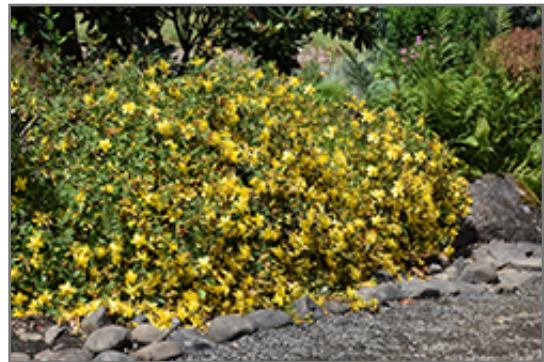
Hidcote St. John's Wort in bloom