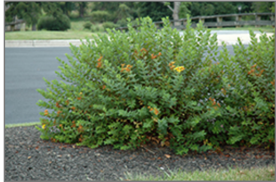
Hidcote St. John's Wort

Hidcote St. John's Wort makes a fine choice for the outdoor landscape, but it is also well-suited for use in outdoor pots and containers. With its upright habit of growth, it is best suited for use as a 'thriller' in the 'spiller-thriller-filler' container combination; plant it near the center of the pot, surrounded by smaller plants and those that spill over the edges. It is even sizeable enough that it can be grown alone in a suitable container. Note that when grown in a container, it may not perform exactly as indicated on the tag - this is to be expected. Also note that when growing plants in outdoor containers and baskets, they may require more frequent waterings than they would in the yard or garden.