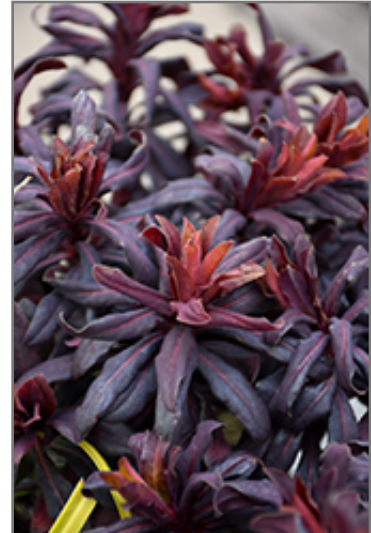
Ruby Glow Wood Spurge flowers

This is a relatively low maintenance plant, and should only be pruned after flowering to avoid removing any of the current season's flowers. Deer don't particularly care for this plant and will usually leave it alone in favor of tastier treats. It has no significant negative characteristics.