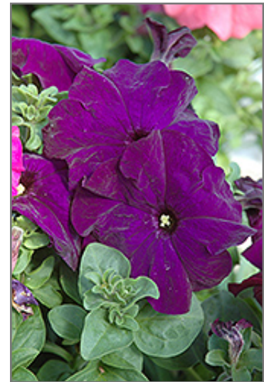
Dreams Midnight Petunia flowers