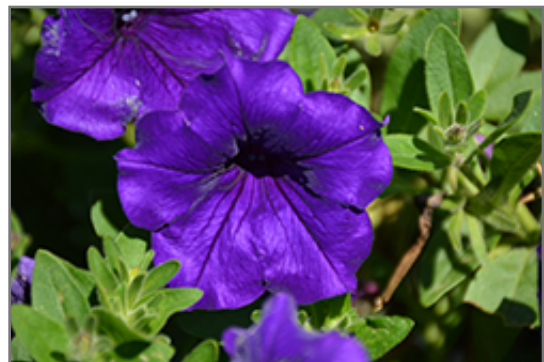
Easy Wave Blue Petunia flowers