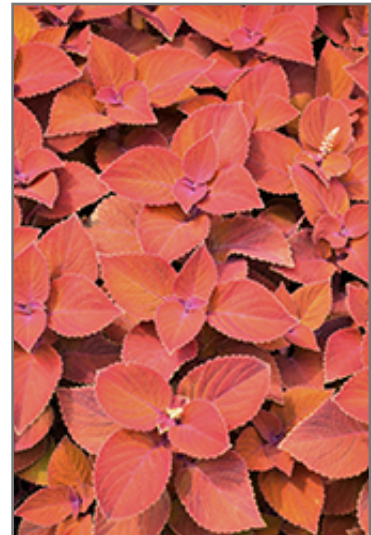
ColorBlaze Sedona Sunset Coleus foliage