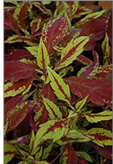
Pineapple Coleus foliage