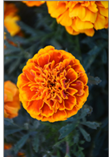
Bonanza Flame Marigold flowers