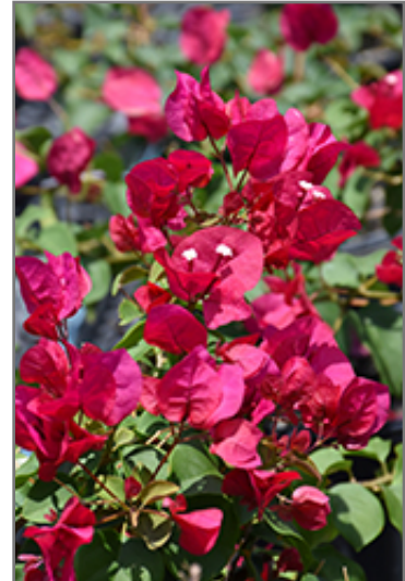
Barbara Karst Bougainvillea flowers

Barbara Karst Bougainvillea is recommended for the following landscape applications;