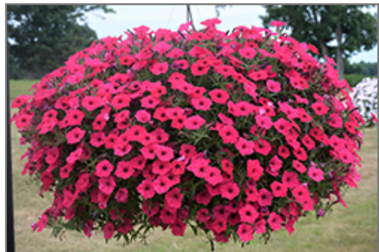
Supertunia Vista Fuchsia Petunia in bloom