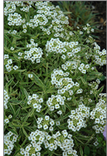
Frosty Knight Alyssum flowers

This plant will require occasional maintenance and upkeep, and should not require much pruning, except when necessary, such as to remove dieback. It is a good choice for attracting bees and butterflies to your yard, but is not particularly attractive to deer who tend to leave it alone in favor of tastier treats. It has no significant negative characteristics.