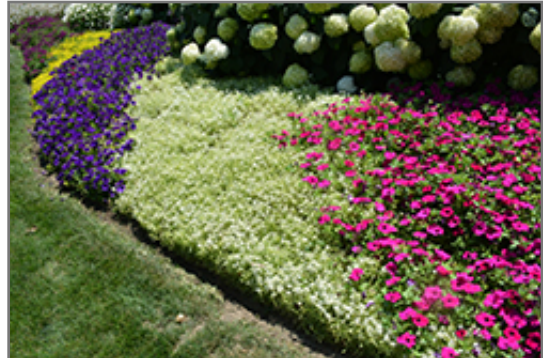
Frosty Knight Alyssum in bloom

Frosty Knight Alyssum is a fine choice for the garden, but it is also a good selection for planting in hanging baskets. Because of its trailing habit of growth, it is ideally suited for use as a 'spiller' in the 'spiller-thriller-filler' container combination; plant it near the edges where it can spill gracefully over the pot. Note that when growing plants in outdoor containers and baskets, they may require more frequent waterings than they would in the yard or garden.