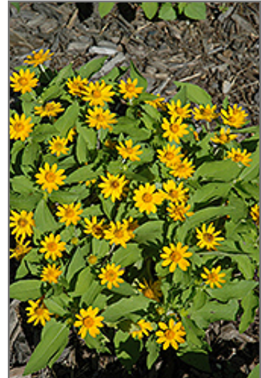
Million Gold Melampodium flowers

Million Gold Melampodium is recommended for the following landscape applications;