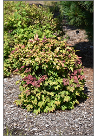
Blush Pink Nandina

Blush Pink Nandina makes a fine choice for the outdoor landscape, but it is also well-suited for use in outdoor pots and containers. It can be used either as 'filler' or as a 'thriller' in the 'spiller-thriller-filler' container combination, depending on the height and form of the other plants used in the container planting. It is even sizeable enough that it can be grown alone in a suitable container. Note that when grown in a container, it may not perform exactly as indicated on the tag - this is to be expected. Also note that when growing plants in outdoor containers and baskets, they may require more frequent waterings than they would in the yard or garden.