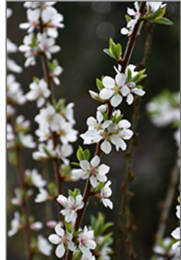
Japanese Bush Cherry flowers

This is a relatively low maintenance shrub, and is best pruned in late winter once the threat of extreme cold has passed. It is a good choice for attracting birds to your yard. It has no significant negative characteristics.