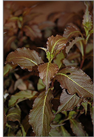
Spilled Wine Weigela foliage

Spilled Wine Weigela makes a fine choice for the outdoor landscape, but it is also well-suited for use in outdoor pots and containers. Because of its height, it is often used as a 'thriller' in the 'spiller-thriller-filler' container combination; plant it near the center of the pot, surrounded by smaller plants and those that spill over the edges. It is even sizeable enough that it can be grown alone in a suitable container. Note that when grown in a container, it may not perform exactly as indicated on the tag - this is to be expected. Also note that when growing plants in outdoor containers and baskets, they may require more frequent waterings than they would in the yard or garden.