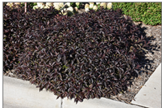
Spilled Wine Weigela