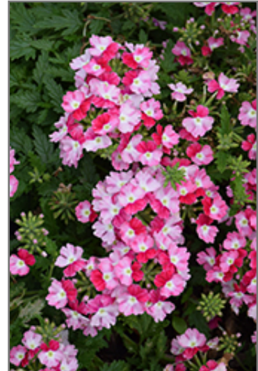
Lanai Twister Red Verbena flowers

Lanai Twister Red Verbena is recommended for the following landscape applications;