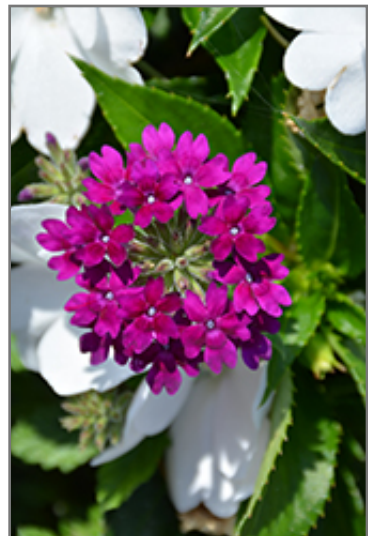
Superbena Royale Plum Wine Verbena flowers