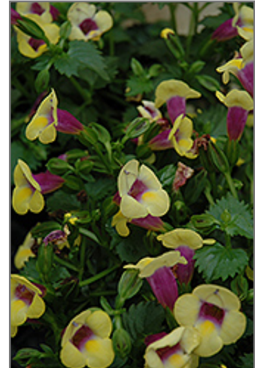
Yellow Moon Torenia flowers

Yellow Moon Torenia is recommended for the following landscape applications;