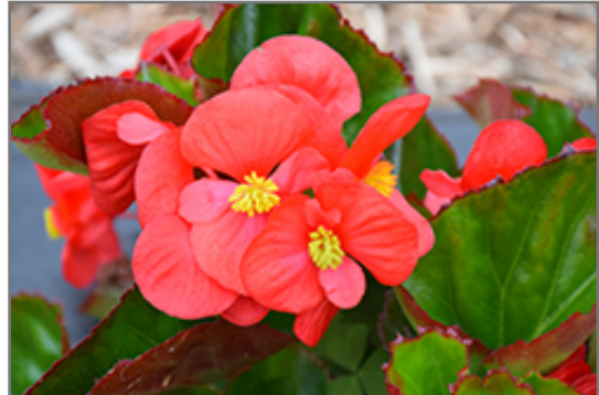
Big Red Green Leaf Begonia flowers

This is a high maintenance plant that will require regular care and upkeep, and usually looks its best without pruning, although it will tolerate pruning. Deer don't particularly care for this plant and will usually leave it alone in favor of tastier treats. Gardeners should be aware of the following characteristic(s) that may warrant special consideration;