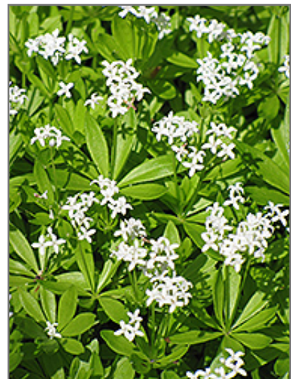
Sweet Woodruff flowers