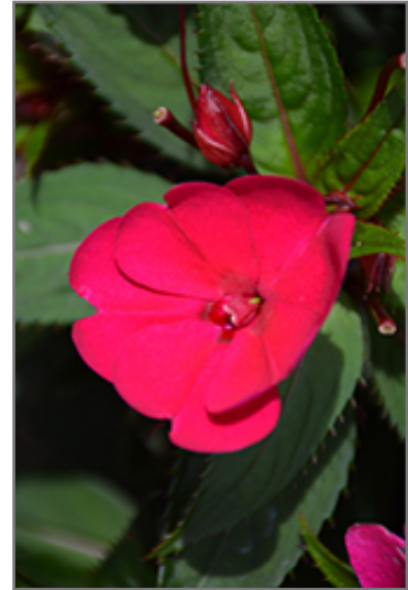
SunPatiens Compact Royal Magenta New Guinea Impatiens flowers

SunPatiens Compact Royal Magenta New Guinea Impatiens is a dense herbaceous annual with a mounded form. Its medium texture blends into the garden, but can always be balanced by a couple of finer or coarser plants for an effective composition.