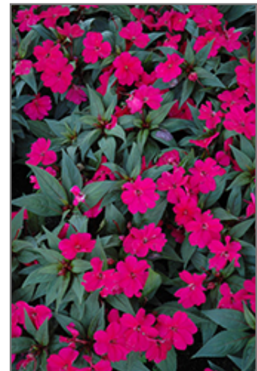
SunPatiens Compact Royal Magenta New Guinea Impatiens flowers