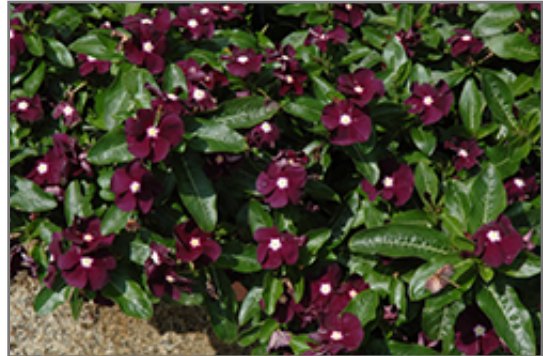
Jams 'N Jellies Blackberry Vinca flowers

Jams 'N Jellies Blackberry Vinca is recommended for the following landscape applications;