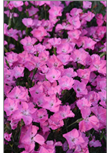
Beauties Kahori Pink Pinks flowers

This is a relatively low maintenance plant, and is best cleaned up in early spring before it resumes active growth for the season. It is a good choice for attracting bees and butterflies to your yard, but is not particularly attractive to deer who tend to leave it alone in favor of tastier treats. It has no significant negative characteristics.