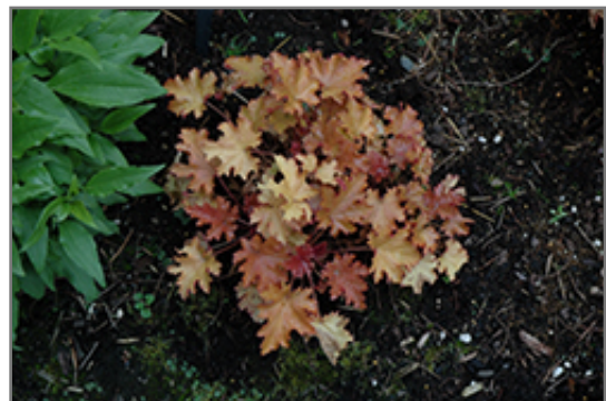
Zipper Coral Bells