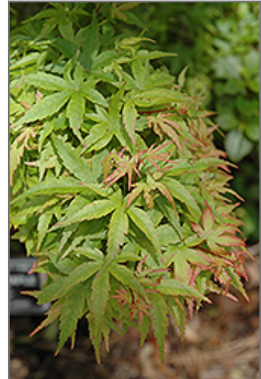
Sharp's Pygmy Japanese Maple foliage

Sharp's Pygmy Japanese Maple is recommended for the following landscape applications;