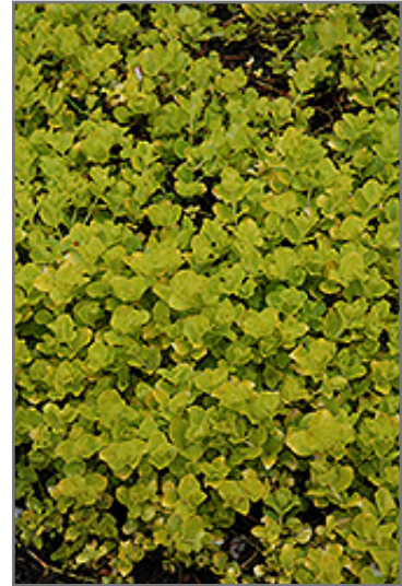
Golden Creeping Jenny foliage

Golden Creeping Jenny is recommended for the following landscape applications;