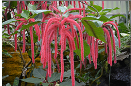
Firetail Chenille Plant flowers