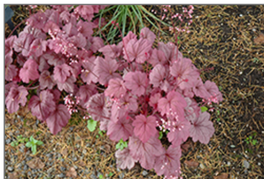
Georgia Plum Coral Bells