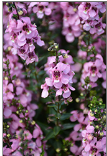
Serenita Pink Angelonia flowers