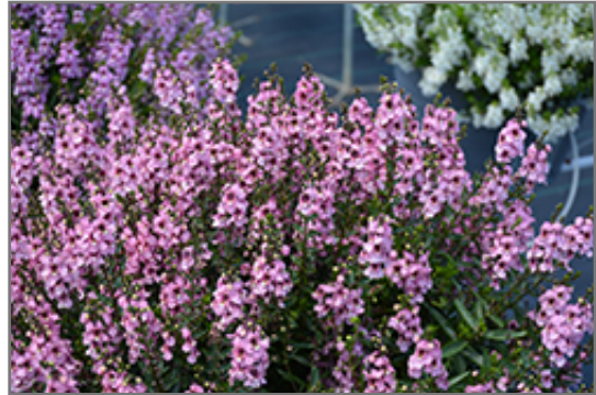
Serenita Pink Angelonia in bloom