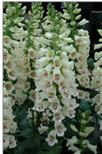
Camelot Cream Foxglove flowers