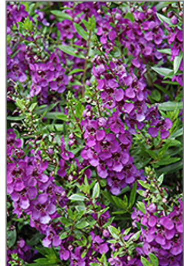
Archangel Dark Purple Angelonia flowers

This plant will require occasional maintenance and upkeep, and should not require much pruning, except when necessary, such as to remove dieback. It is a good choice for attracting butterflies to your yard, but is not particularly attractive to deer who tend to leave it alone in favor of tastier treats. It has no significant negative characteristics.